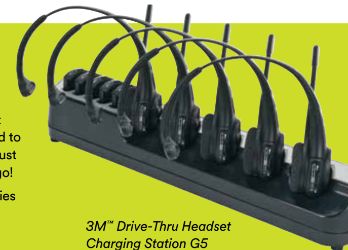
3M™ Drive-Thru Headset Charging Station G5